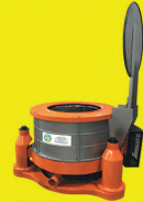
HYDRO EXTRACTOR THREE LEG SUSPENSION CAPACITY:15,30,60,120KG