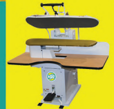
DRY CLEANING UTILITY PRESS