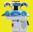
CUFF AND COLLAR