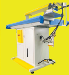
VACUUM FINISHING TABLE CUM INBUILT BOILER WITH IRON BOX